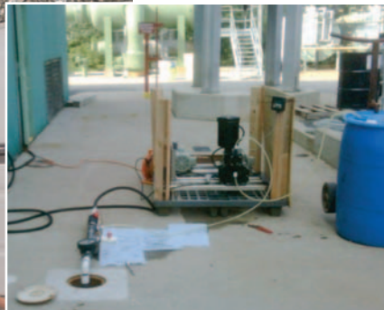
Typical Site Setup

VeruSOLVE-HP™ is applicable to all size sites and available for direct purchase.